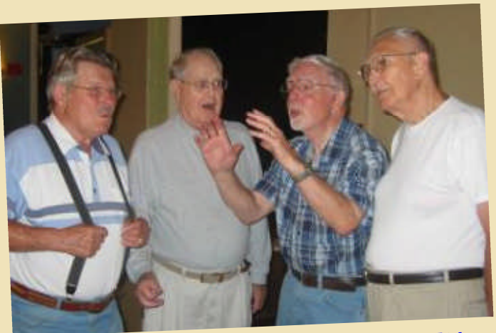
Bob's Got It!

Dedicated to Traditional Barbershop Quartet Singing