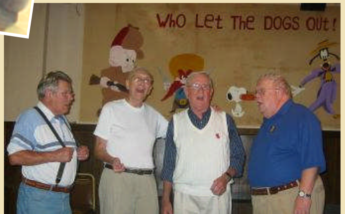
"Who Let the Dogs Out"