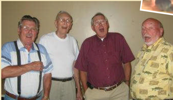
You're as Welcome As the Flow'rs in May